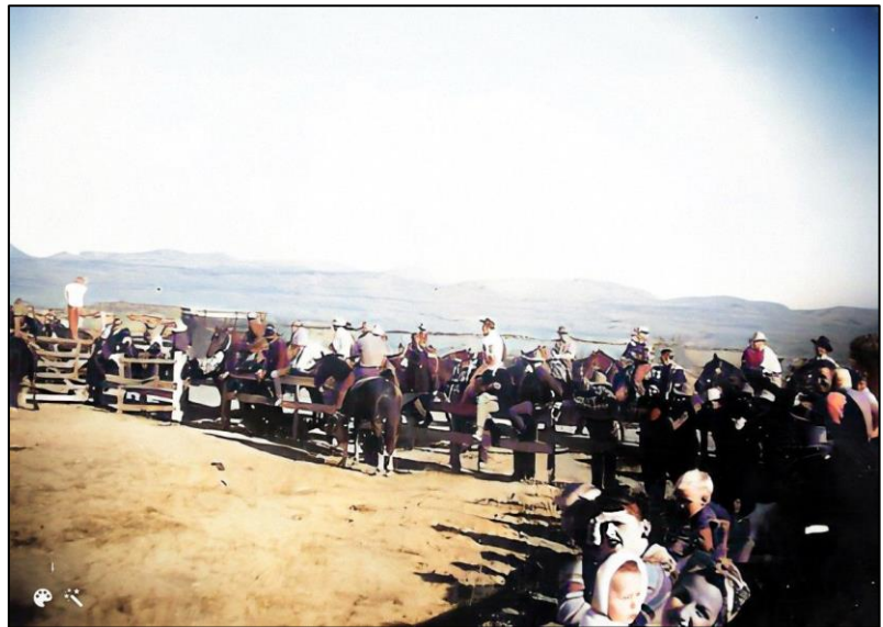
The crowd—best seats in the house!