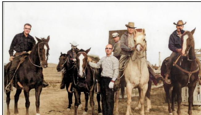
The 1968 Rodeo Committee:

This is one of our cherished hometown traditions from the past.